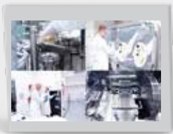
Aseptic Processing Technologies