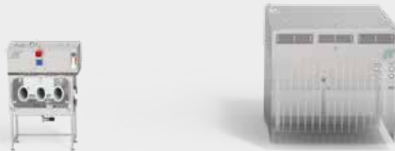
Formulation / Personal Protection