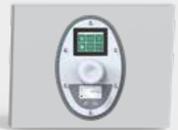
Glove Testing System