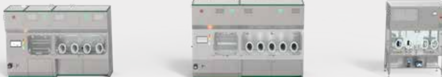
Laboratory / Small Scale Production